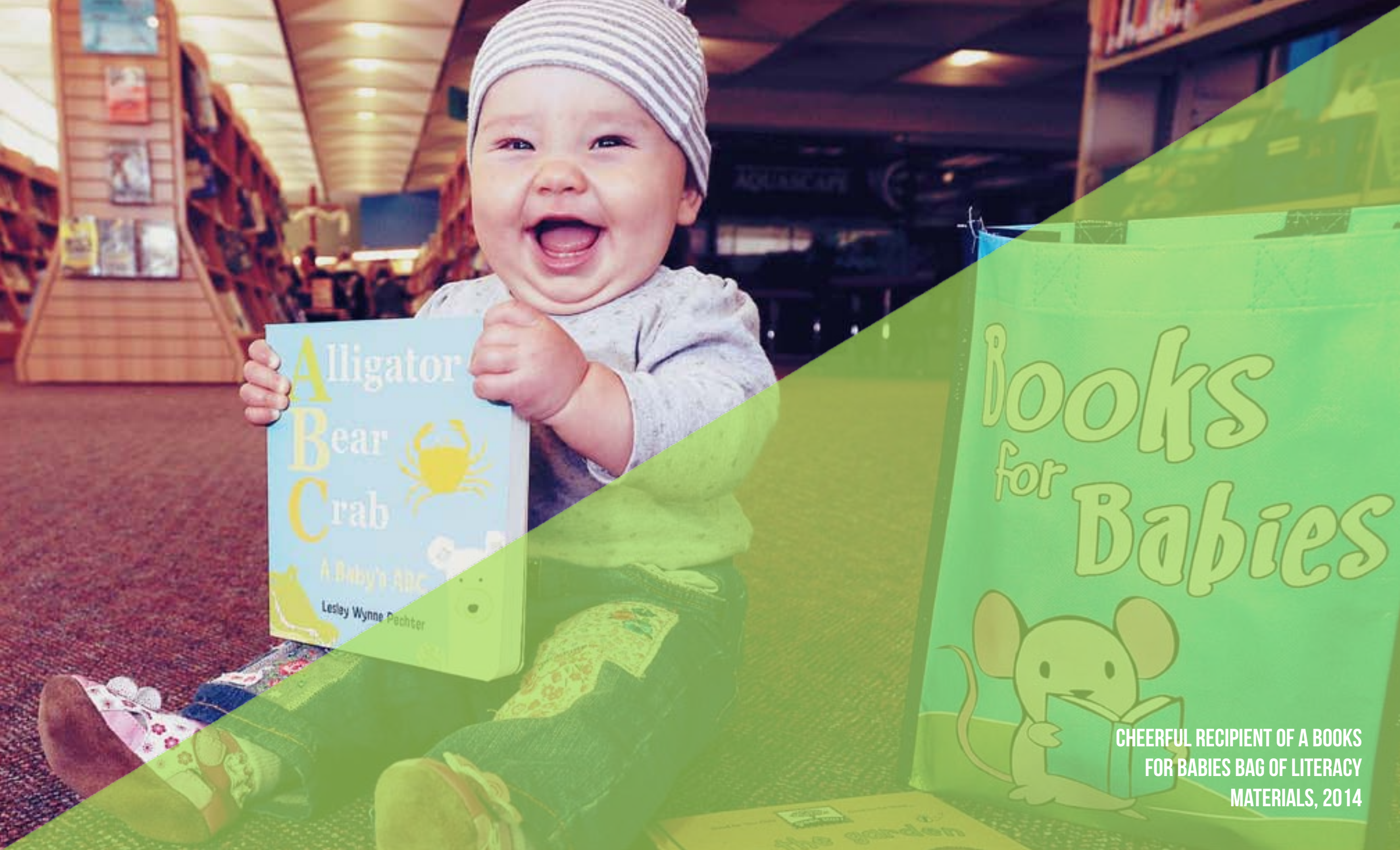
CHEERFUL RECIPIENT OF A BOOKS FOR BABIES BAG OF LITERACY MATERIALS, 2014