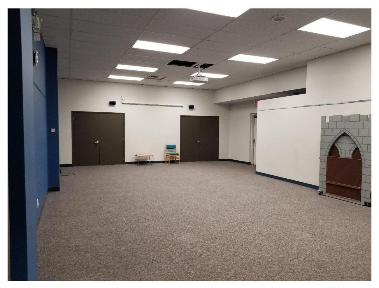
The lights in this room are very bright and it is not possible to dim them.

Library programs at the Nechako Branch happen in the children's area and in the Multipurpose Room.