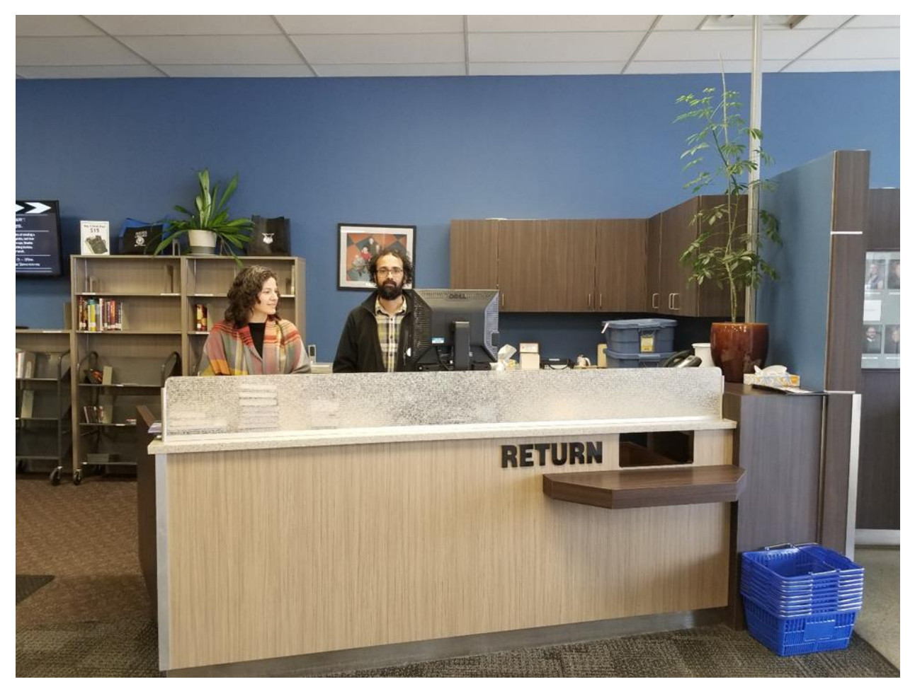
You can return items in the return slot.

When you enter the building, you'll see a desk. Staff at this desk can help you get a library card and borrow library materials, such as books and music CDs.