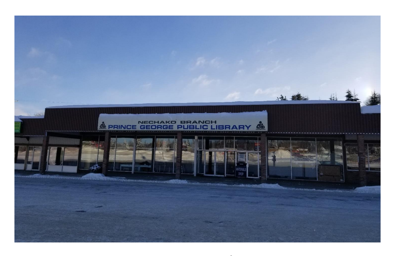
6547 Hart Highway Prince George, B.C., V2K 3A4

Nechako Branch, Prince George Public Library, Visual Story <a href="https://www.pgpl.ca">www.pgpl.ca</a>