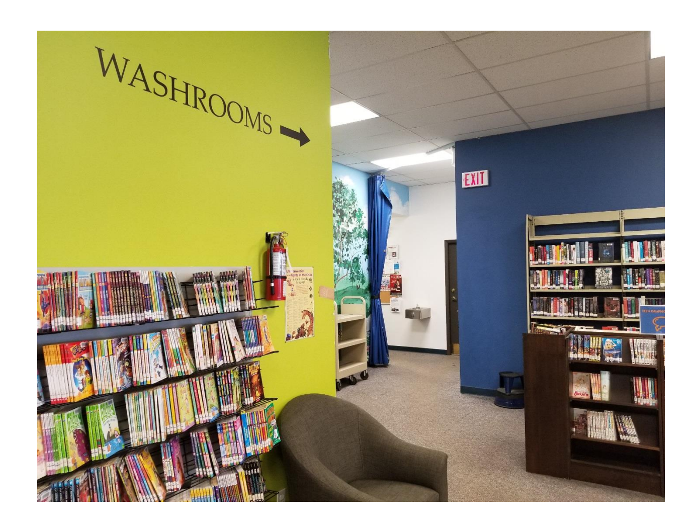
There are accessible stalls in each washroom.

There are washrooms located at the back of the library. If you need help finding the washrooms, ask a staff member.