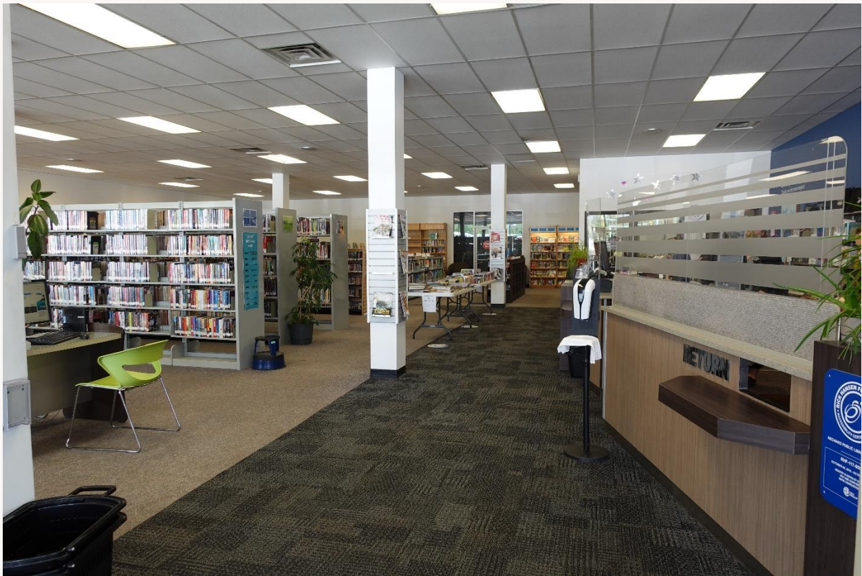
Nechako Branch, Prince George Public Library, Visual Story

The Nechako Branch is all on one level. There are no stairs or elevator.